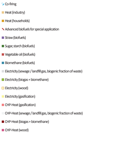
Figure 2: Indicative trends in bioenergy up to 2050 as a synthesis of the project "Milestones 2030"